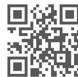
Referred Care Outside of Hawaii

*It is imperative that you understand this completely before any mainland services are received.